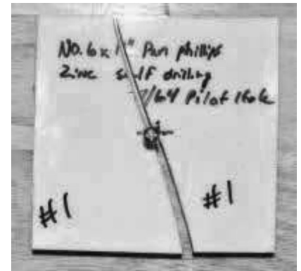
Figure 1: Failure